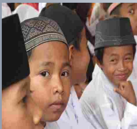
The aspiring students of Lambeh village school having great moments of excitement.