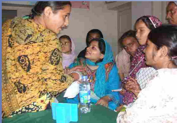
A view of busy female clinic in Mirpur Khas in Sindh