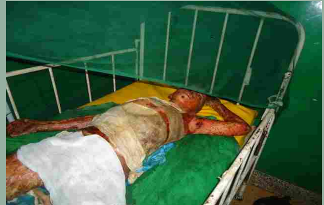
A child with 3rd degree burn in the Children ward of Banadir Hospital