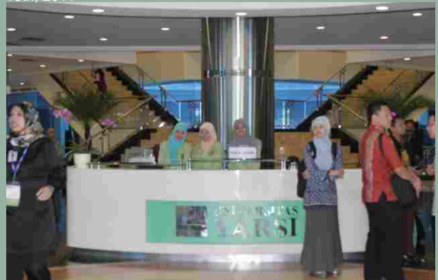
Help desk in the reception hall