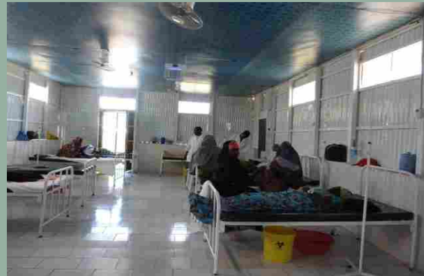
A view of inpatient ward at Banadir Hospital, Mogadishu