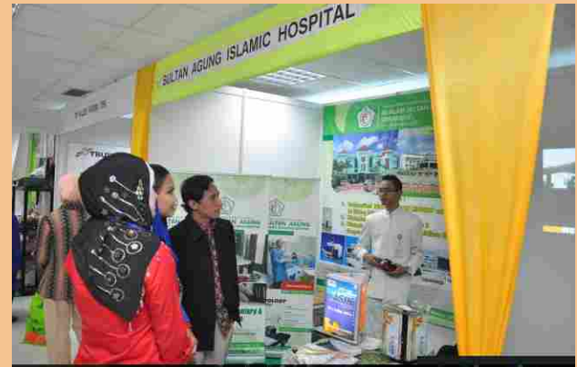
A nicely arranged exhibition attracted local and foreign delegates