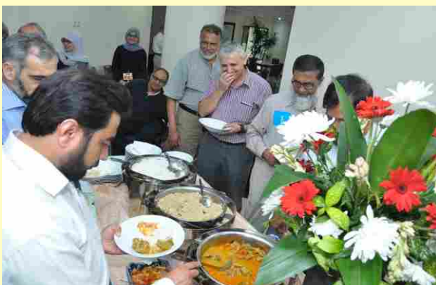
The delegates enjoyed delicious Indonesian spicy foods during their stay in Jakarta