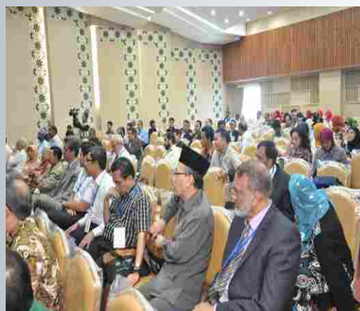
A view of audience during the scientific convention

associated diseases and its sequel. Harsh realities and those unaddressed issues were thrashed out which included scientific bases of Geriatrics, common issues and illness related to old age, their management and social rehabilitation of those suffering.