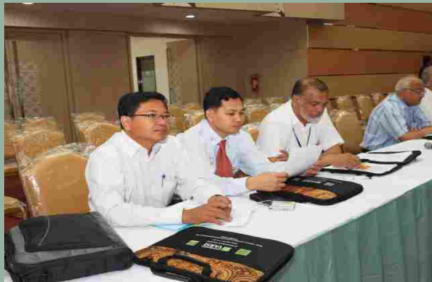
IMA Cambodia was represented by its two delegates