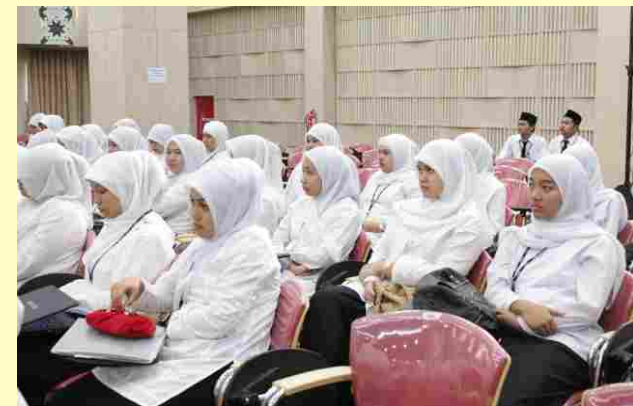
A view of the opening ceremony of scientific convention