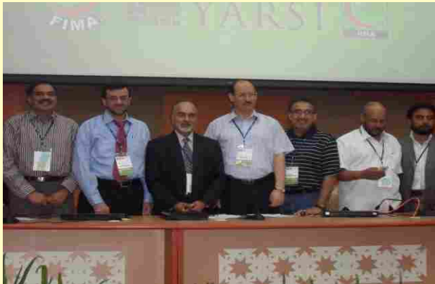
Delegates from IMANA and IMA Queensland, Australia with FIMA office bearers