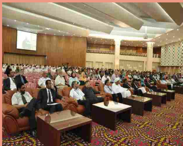
A view of the Inaugural ceremony of the FIMA-IIMA-YARSI Scientific meeting on September 16th, 2011