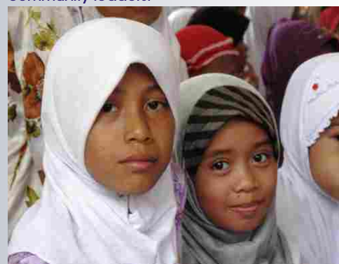
The girls of Hizf section smiling and greeting the guests.

A devastating earthquake hit the eastern Turkey on 23rd Oct, 2011, 300 people were reported dead & over 1500 were injured. A team of DWW (Turkey) & Hayat Foundation rushed to the epicenter of the earthquake & rescue services were started without any delay. We are in touch with our brothers in Turkey & FIMA relief has offered medical relief services to Hayat Foundation.