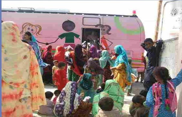
More than 200 patients were examined everyday by the mobile MCH hospital