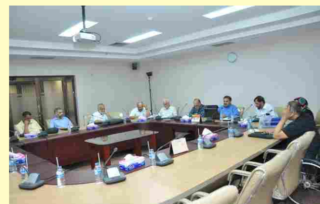
A view of FIMA pre Council EXCO meeting on September 13th, 2011