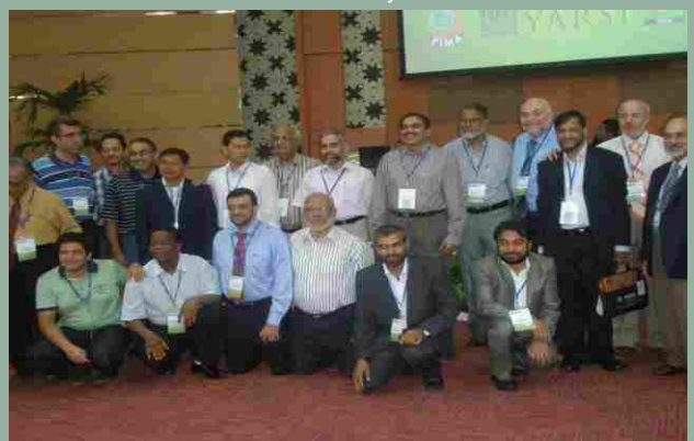
A view of delegates on day two of FIMA council meeting on September 15th, 2011