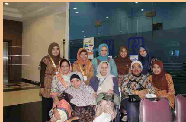
A record number of female delegates attended the FIMA meeting