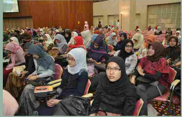
CIMCO delegates attending the parallel session on September 15th, 2011