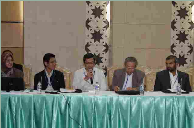
Speakers at the scientific session on September 16th, 2011