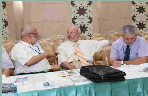
Exchange of ideas during the coffee break