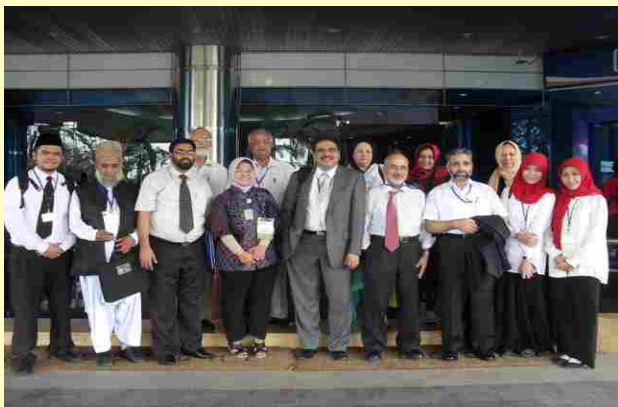
The delegates greeted by the reception committee on 13th September 2011