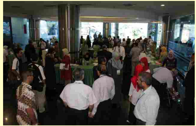
A view of reception hall, the officials busy with registration of delegates