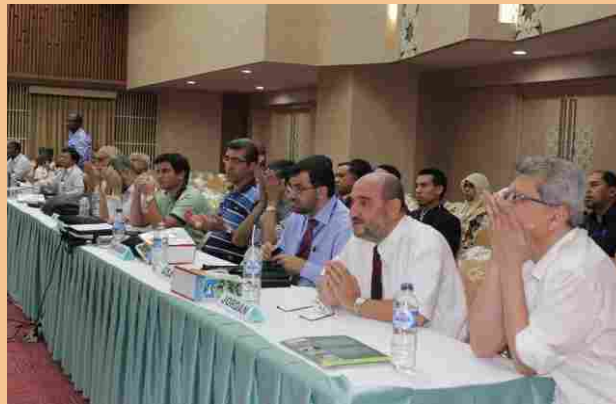
A view of FIMA council meeting, the delegates making dua.