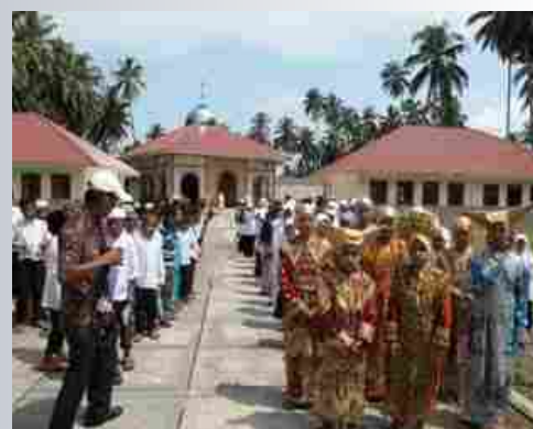
School students lined up to greet the guests