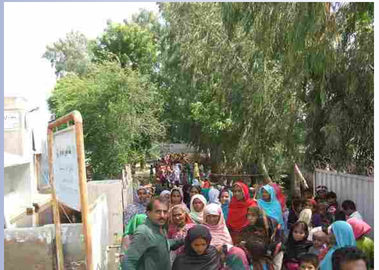
A long queue of the villagers waiting for their turn to be examined

صوبہ سندھ اس وقت تاریخ کے بدترین سیلاب سے دوچار ہے۔ گزشتہ ماہ اگست کے اواخر میں مون سون بارشوں میں غیر معمولی اضافے کے باعث سندھ کے بیشتر اضلاع پانی کی زد میں آگئے اور ایک اندازے کے مطابق 50 لاکھ افراد اس سیلاب سے متاثر ہوئے۔ رپورٹس کے مطابق 40 لاکھ ایکڑ زمین زیر آب آئی جس میں سے 17 لاکھ ایکڑ پرنفیس تیار کھڑی تھیں۔ ایک لاکھ 50 ہزار سے زائد مکانات تباہ ہو چکے ہیں اور لوگ بے سروسامانی کے عالم میں انداد کے منتظر ہیں۔ متاثرہ علاقوں میں مختلف بیماریوں کے باعث 170 افراد جاں بحق ہو چکے ہیں۔ ماہرین صحت کے مطابق وہاں ٹیبریا، ڈائریا، ماس، جلد اور آنکھوں کی بیماریاں تیزی کے ساتھ پھیل رہی ہیں۔