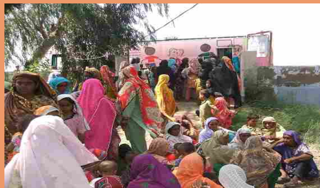
A view of beneficiaries of medical help by IMANA-PIMA Mobile Mother & Child Hospital

The IMANA PIMA relief team is in need of more supply of medicine and food supplements. An appeal is made to all to help the affected masses at this hour of need.