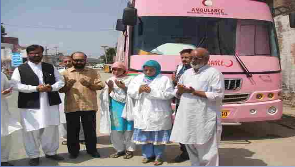
Dua being made before the departure of IMANA-PIMA mobile MCH Hospital to flood affected areas in Sindh