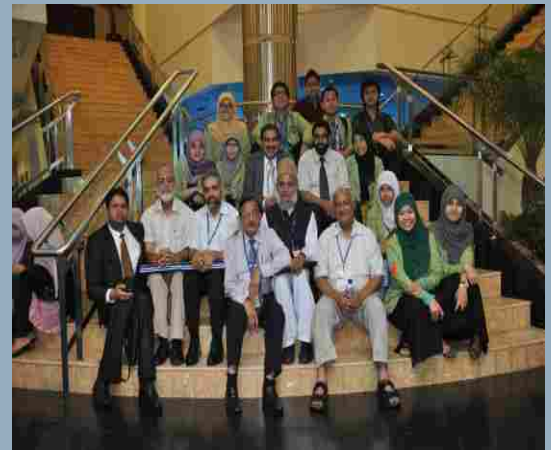
Pakistani and Indian delegates during a lunch break with the young members of organizing committee