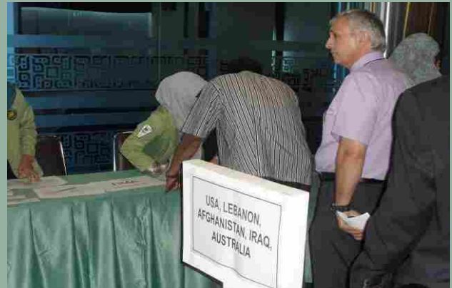
A very organized system of daily attendance was arranged by An efficient team of YARSI University