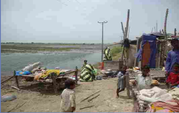
Thousands of homeless people were provided medical help by IMANA - PIMA medical relief teams