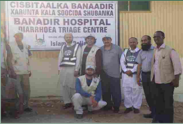
FIMA doctors with Islamic Relief staff at Banadir Hospital in Mogadishu