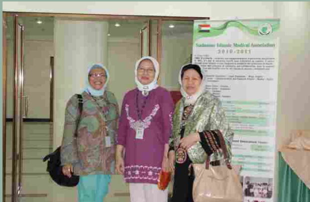
Nice moments to share with .....