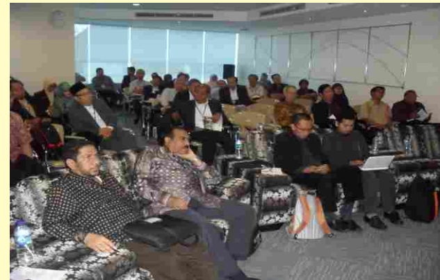
A view of IHC meeting on September 15th, 2011