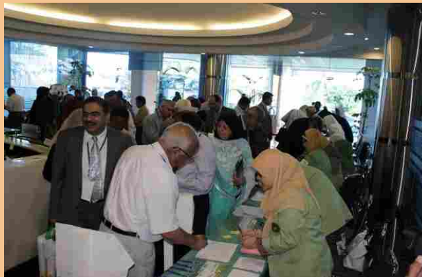
The delegates at registration counter on day one of the FIMA Council Meeting