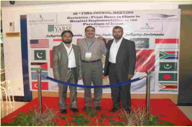
There was no Pak-Afghan border in Jakarta meeting